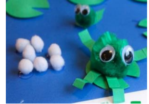
Life cycle of a frog.