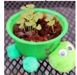
Turtle herb planting.